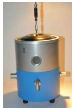
EX 58 C40