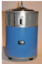
EX 220 C40