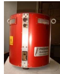
EX 1070 C50

The shakers EX 58 C40 and EX 220 C40 are compatible with the standard amplifiers types A 735 and A 648 S and therefore directly interchangeable with the earlier designed shakers types EX 58 and EX 220 SC.