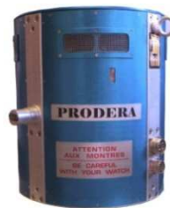
EX 520 C50